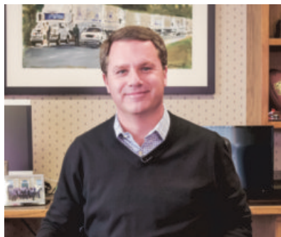
Doug McMillon, CEO & President, Walmart

Walmart team optimise aisle assortment, reduce customer wait-times and solve many other problems for the business.