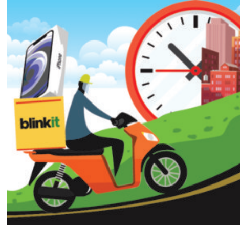
Illustration BINAY SINHA

When asked if Blinkit shall keep Apple products inventory at its warehouse, a company spokesperson said: "We have partnered with Unicorn, one of the most prominent resellers of Apple products in India, to market and deliver iPhone 14 and other Apple products. Our delivery partners will be delivering products utilising Unicorn's