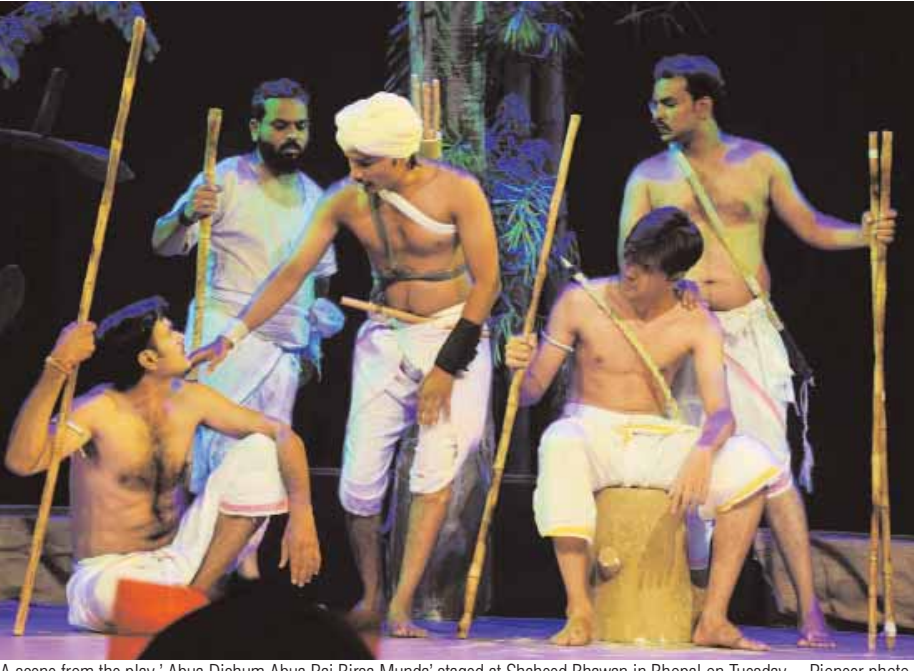
A scene from the play 'Abua Dishum Abua Raj Birsia Munda' staged at Shaheed Bhawan in Bhopal on Tuesday.

BHOPAL: Chief Minister Shivraj Singh Chouhan has said that in revamping the 'Adopt an Anganwadi' campaign, it is the sacred objective that our children are healthy and nourished. This objective cannot be fulfilled by the administrative machinery alone. Public participation is essential for the success of the campaign. There are about 97 thousand Anganwadis in the state. People's involvement is necessary to make them better. Chief Minister Chouhan addressed the ministers before the start of the meeting of the Council of Ministers at Mantralaya on Tuesday. He said that the general public should be motivated to make Anganwadi centres convenient.